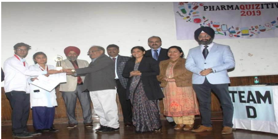
First Prize Winner