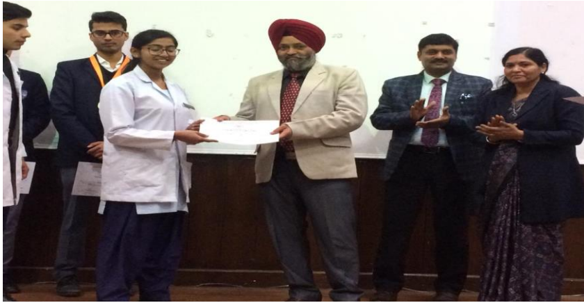
Third prize winner